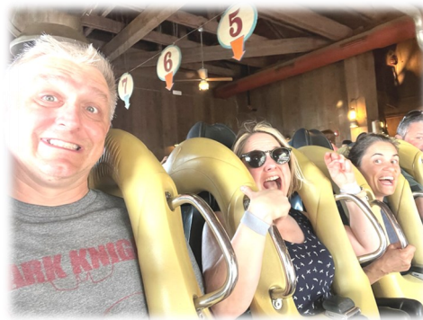
Fearless chaperones at Silver Dollar City Amusement Park.

What is one thing you will remember from this trip? I will remember the people at the conference, it was a nice and cooperative community.